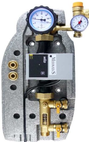
WILO Yonos Para pump connection